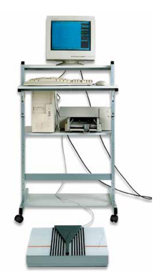
Figure 1. The apparatus for the test by moiré method [11]

sand 70 (27.34%) 15-year-olds. The size distributions of age and sex groups did not differ significantly. The study was performed in November and December, 2005. The research approach used a spatial photogrammetry technique that used the effect of projection moiré (Figure 1) [10, 11]. Path length was tested on an R50300 Cosmogamma platform by Emildue (Figure 2) [12]. The path length is the total distance that the COP covered in both planes during the 30 s