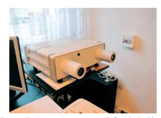
Figure 2. The R50300 Cosmogamma platform by Emildue [12]